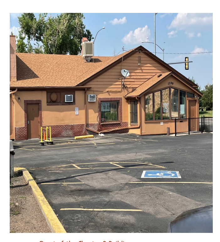
Front of the Chapter 3 Building.